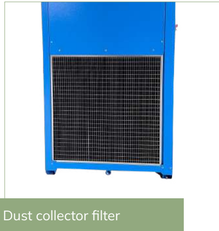
Dust collector filter