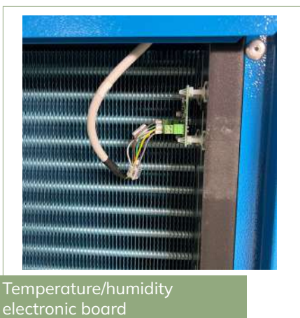
Temperature/humidity electronic board