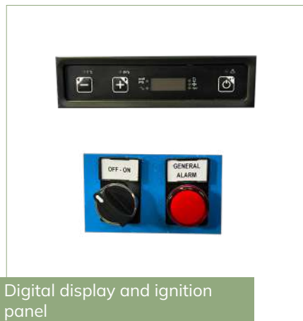
Digital display and ignition panel