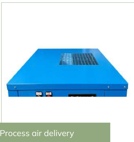
Process air delivery